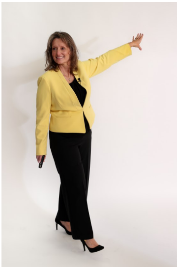
Fort Worth, Texas